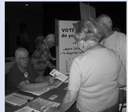
Senior Fair, LWV Beloit