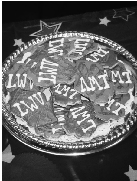
Cookies made by LWV Whitewater Area

In the business portion of the Annual Meeting, delegates approved a slate of officers and directors, a bylaws revision in compliance with the 501(c)(3) group exemption and an organizational budget for the coming year. The board recommended that, rather than conduct a new study this year, the state League should continue to advocate on health care, sustainability, voting rights and judicial impartiality issues. This decision, made in light of limited resources and a challenging political environment, was accepted by delegates. ❖